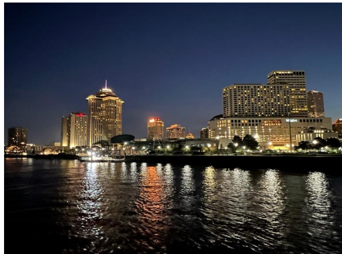
Lake Pontchartrain reflecting the lights of New Orleans

Cindy reports, "New Orleans was my first International Convention, and I got to meet ladies from all over the U.S. and other countries. The breakout sessions, as well as the general meetings for discussing and voting on proposed amendments, were very educational for a convention newbie!"