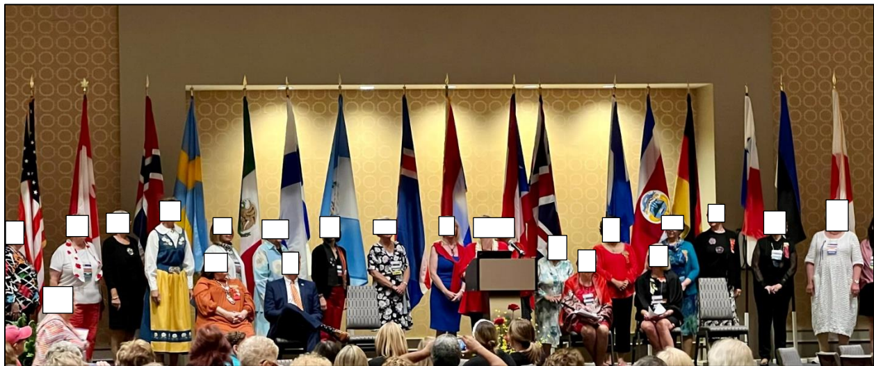
Tuesday evening, First General Meeting, Ceremony of Flags representing the 17 attending countries