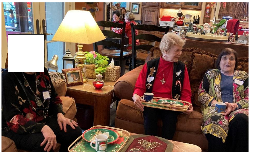
DKG Purpose 7: To unite women educators in a genuine spiritual fellowship