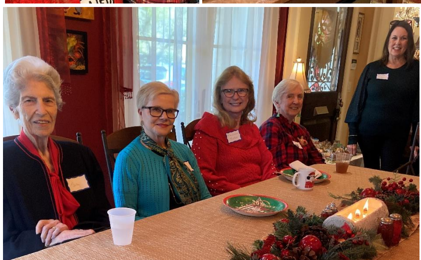
Hospitality means receiving and entertaining guests in a way that makes them feel well taken care of.