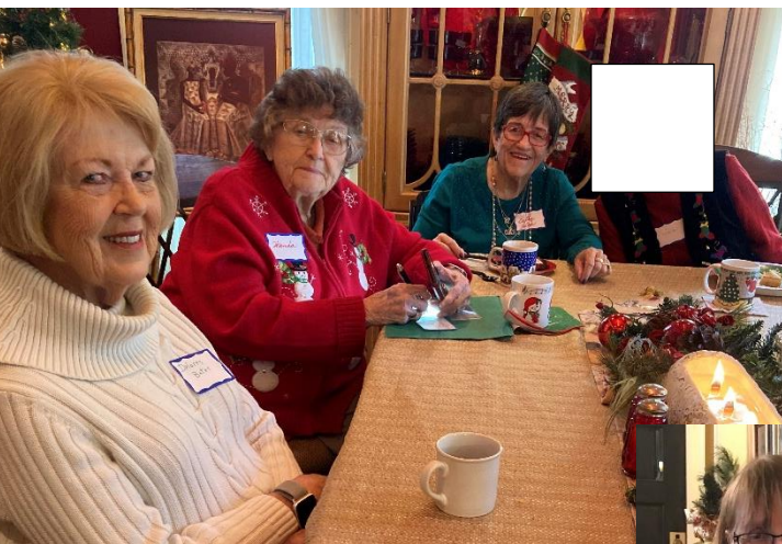
Fellowship (friendly association, especially with people who share one's interests) = a DKG purpose.